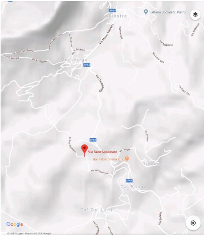
Via Sant'Apollinare 47033 Carpineti, Province of Reggio Emilia, Italy

Castello di Casteldaldo is situated approximately 8 kms from Carpineti just off the SP64 provincial road and close to the village of Valestra, which offers an organic bakery, two butchers (one organic), hairdresser, bar, newsagents, convenience store, small petrol station and award-winning Parmesan cheese dairy.