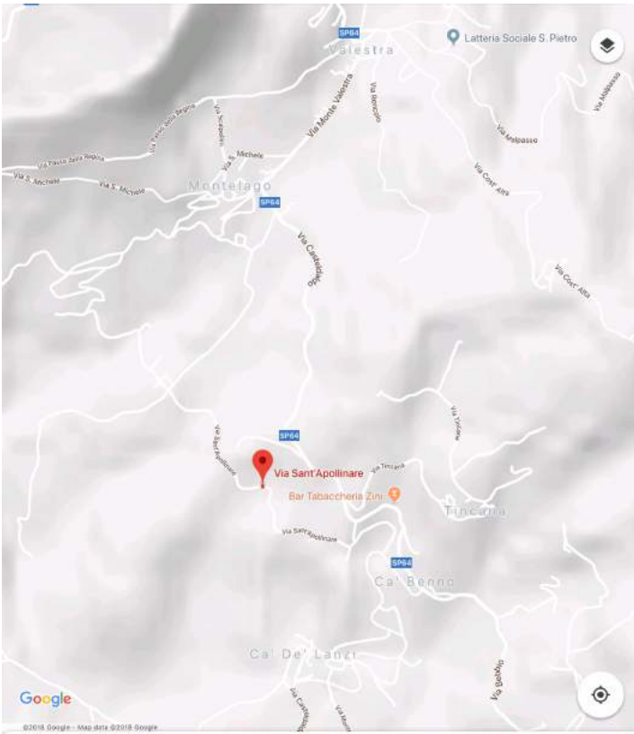
Via Sant'Apollinare 47033 Carpineti - Province of Reggio Emilia - Italy

Castello di Casteldaldo is situated approximately 8 kms from Carpineti just off the SP64 provincial road and close to the village of Valestra, which offers an organic bakery, two butchers (one organic), hairdresser, bar, newsagents, convenience store, small petrol station and award-winning Parmesan cheese dairy.